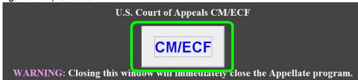
Figure 1. CM/ECF Button