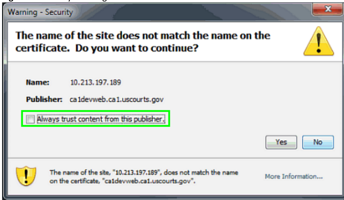
Figure 2. Security Warning