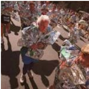
The overlooked part of exercise — recovery