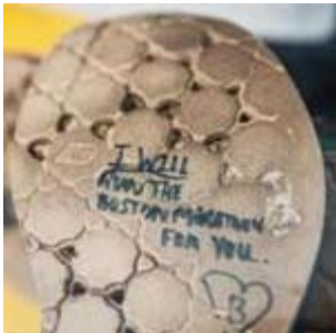
EDITORIAL Bombings proved