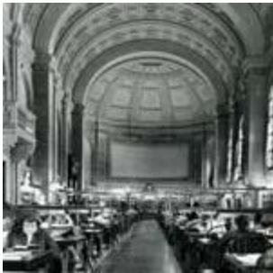
OPINION | DENNIS LEHANE Library wasn't the target — what was inside was