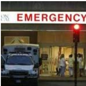
THE PODIUM Boston's trauma teams were ready