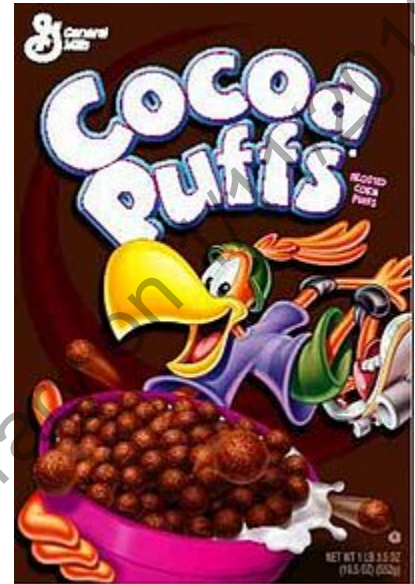
A Cocoa Puffs box, 2001.