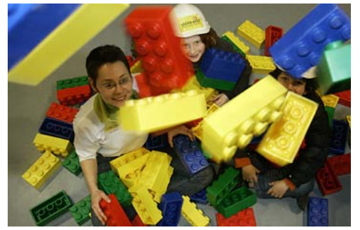
Playing with lego