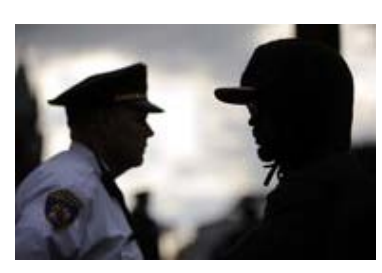
Police Silence in Baltimore