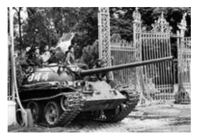
Lessons, 40 Years After the Fall of Saigon