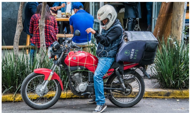
Uber's food delivery service, Uber Eats, uses motorbikes and cars to deliver food in Mexico City.