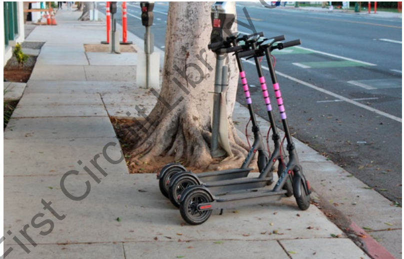
Lyft launched its own branded electric kick scooters in Santa Monica, CA in 2018.

TNC ridership has rapidly expanded in recent years as the availability and convenience of on-demand ridesourcing has spread to more and more cities. A 2018 study found that daily trips in New York City on Uber and Lyft jumped from 60,000 in 2015 to 600,000 in 2018. 3 As of 2017, DiDi reportedly carried out up to 25 million daily trips across 400 cities in China. 4