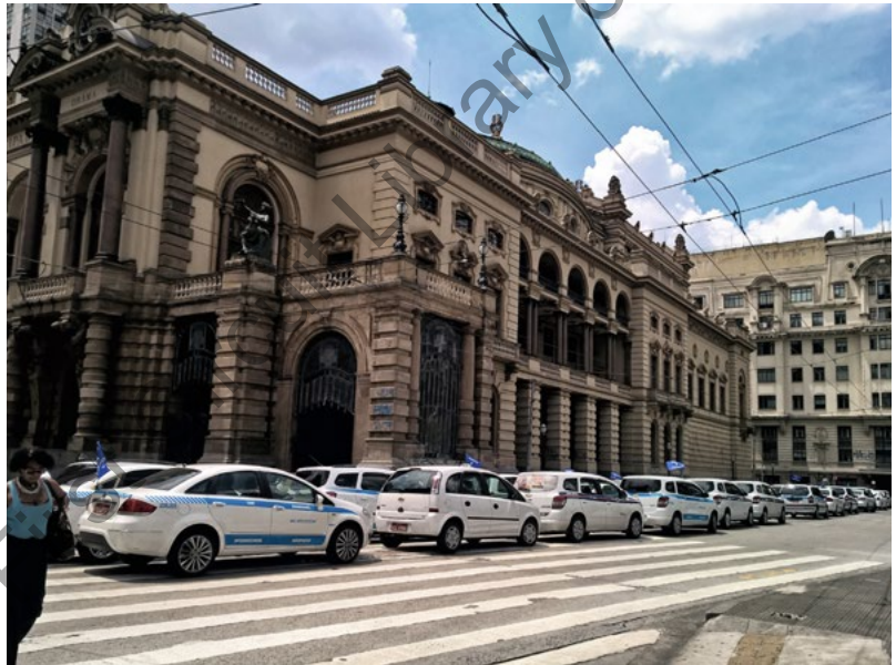
Licensed taxi drivers in São Paulo parked in front of the city's Opera House (Theatro Municipal) to protest Uber in 2015.

A similar response was mounted after the launch of Uber's less expensive UberX service (which uses nonprofessional drivers and any type of vehicle, not just black cars and SUVs) in São Paulo in 2014. Ridership, as well as drivers for the service, increased exponentially, and in 2015 the city's taxi union mounted forceful, violent demonstrations, claiming that Uber violated competition rules and did not carry out sufficient safety checks on drivers and vehicles. 27 This eventually led to an outright ban on unregistered vehicles operating as TNCs. The taxi lobby in São Paulo also pushed for a ban on shared TNC rides, which succeeded; "carpool TNCs," like BlaBlaCar, may operate in the city, but only as not-for-profit entities (driver and passengers split costs for a trip, with a fee charged only to connect these parties), and privately operated vanpools, like Jetty and Urbvan, which provide fixed, express route service, have been banned since the early 2000s.