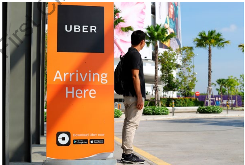
A passenger waits for his Uber at a pickup point in Penang, Malaysia

While few cities have implemented curb pricing for TNCs, many charge additional fees for trips made to highly congested destinations. For example, Chicago charges an additional US$5 fee for trips made to both of the city's airports, McCormick Place (a downtown convention center), and Navy Pier (an iconic downtown attraction). Other cities, like Washington, DC, have implemented designated TNC pickup and drop-off zones on popular commercial streets that see heavy congestion during weekend evening hours. While these zones are not currently priced, they could eventually carry a fee per trip as an additional means of managing demand for curb space.