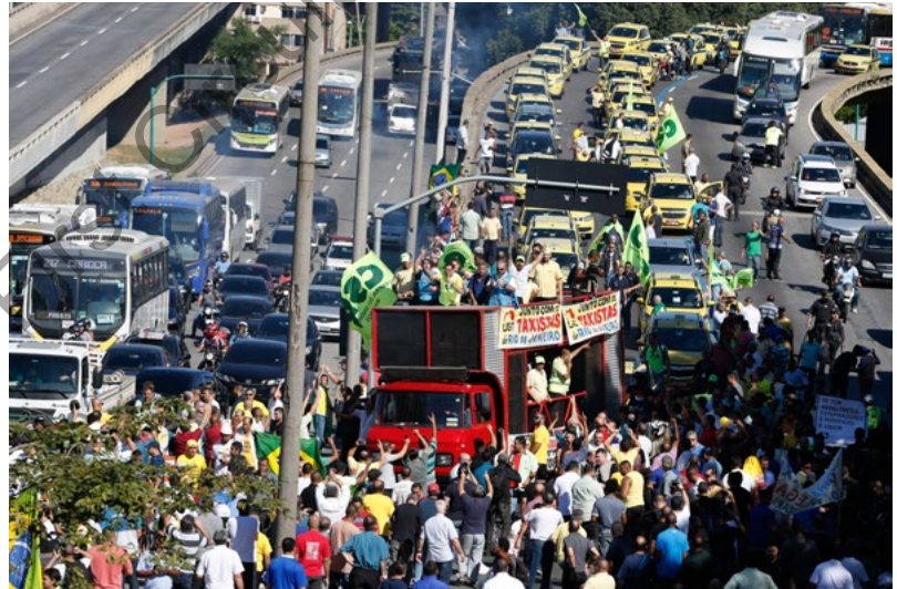
Anti-TNC protests staged by taxi drivers blocked traffic on major roads in Rio de Janeiro.

Incumbent transport operators—taxi drivers, informal transit providers, etc.—in developing cities are usually powerful political players and can directly influence policies regulating TNCs. Typically, existing operators are vocal advocates of banning or severely restricting TNC operations. In Mexico City, drivers of colectivos (typically minivans or shared taxis) successfully lobbied the government to prohibit TNCs from offering shared (also referred to as “pooled”) rides. While this result protects the colectivo drivers, it does not align with goals to reduce private vehicle trips, nor does it encourage the use of (or connection to) more sustainable modes like transit, cycling, or walking.