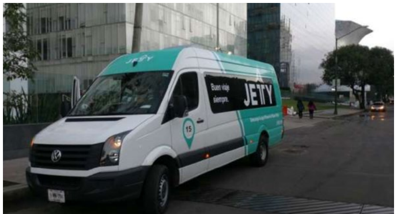
Vanpool service provided by private companies like Jetty, which operates primarily in Mexico City, are banned in São Paulo.