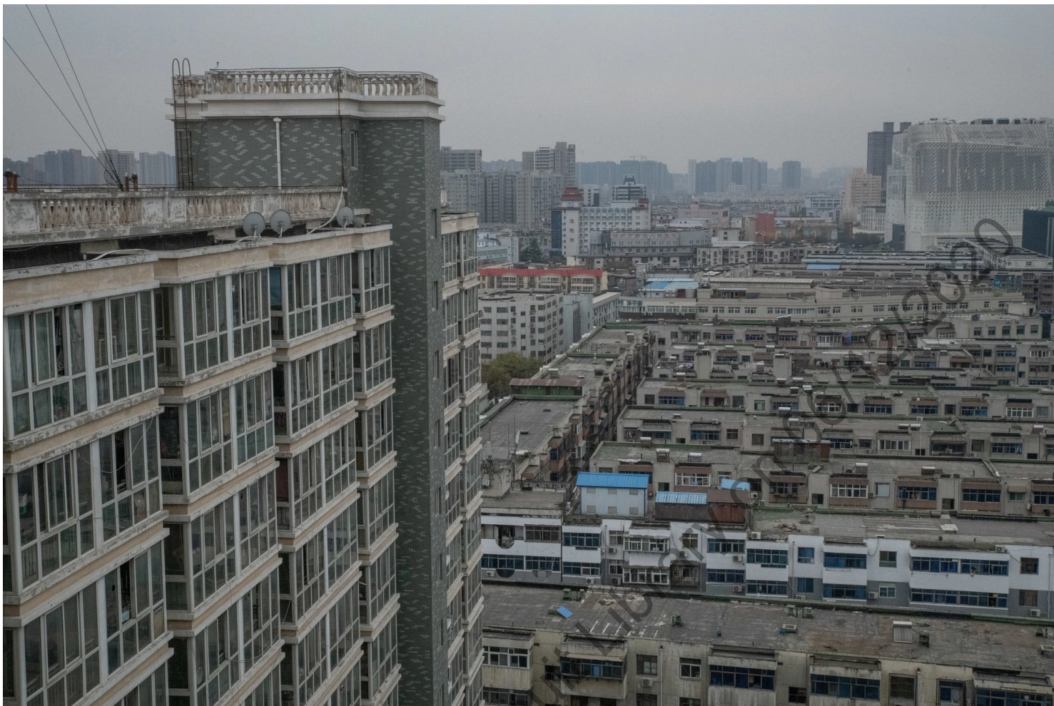
The Huating Apartments residential complex, where a surveillance system matches residents' faces to phone numbers.