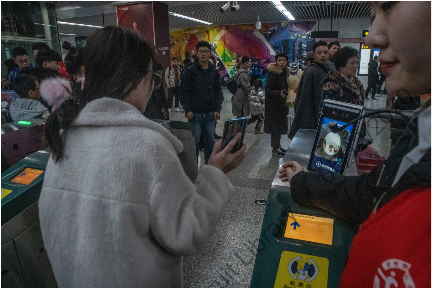
A facial recognition scanning system at the entrance of the subway station near Huating Apartments.