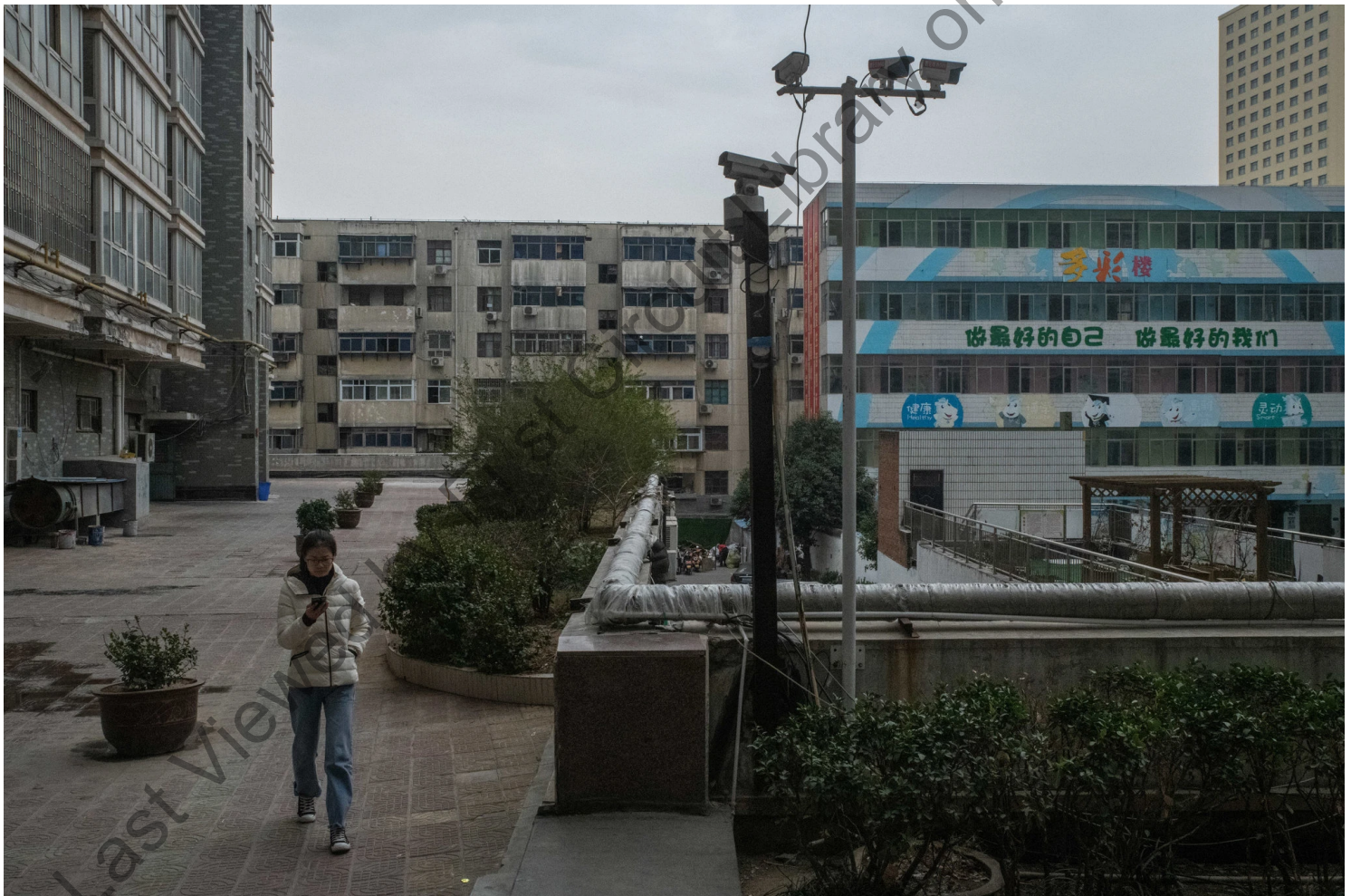
Surveillance cameras at the Huating Apartments residential complex.