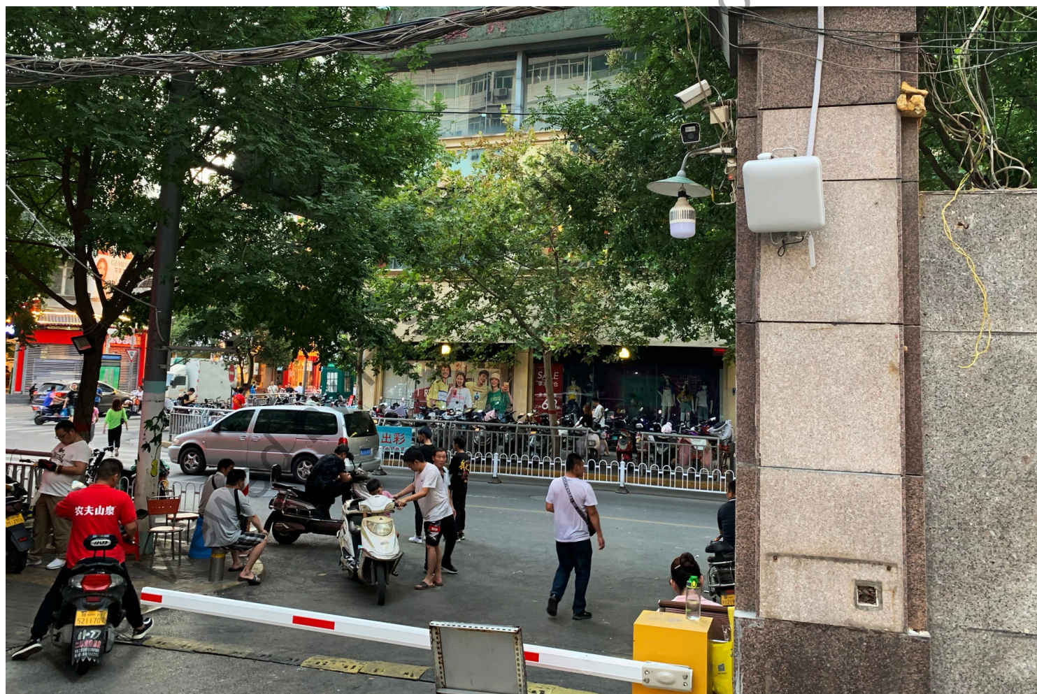
Phone identification scanners — called IMSI catchers — collected identification codes from mobile phones at the entrance of the complex. Paul Mozur

Even for China's police, who enjoy broad powers to question and detain people, this level of control is unprecedented. Tracking people so closely once required cooperation from uncooperative institutions in Beijing. The state-run phone companies, for example, are often reluctant to share sensitive or lucrative data with local authorities, said people with knowledge of the system.