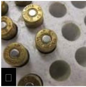
Photos of the evidence

Last Viewed by First Circuit Library on 05/01/2015