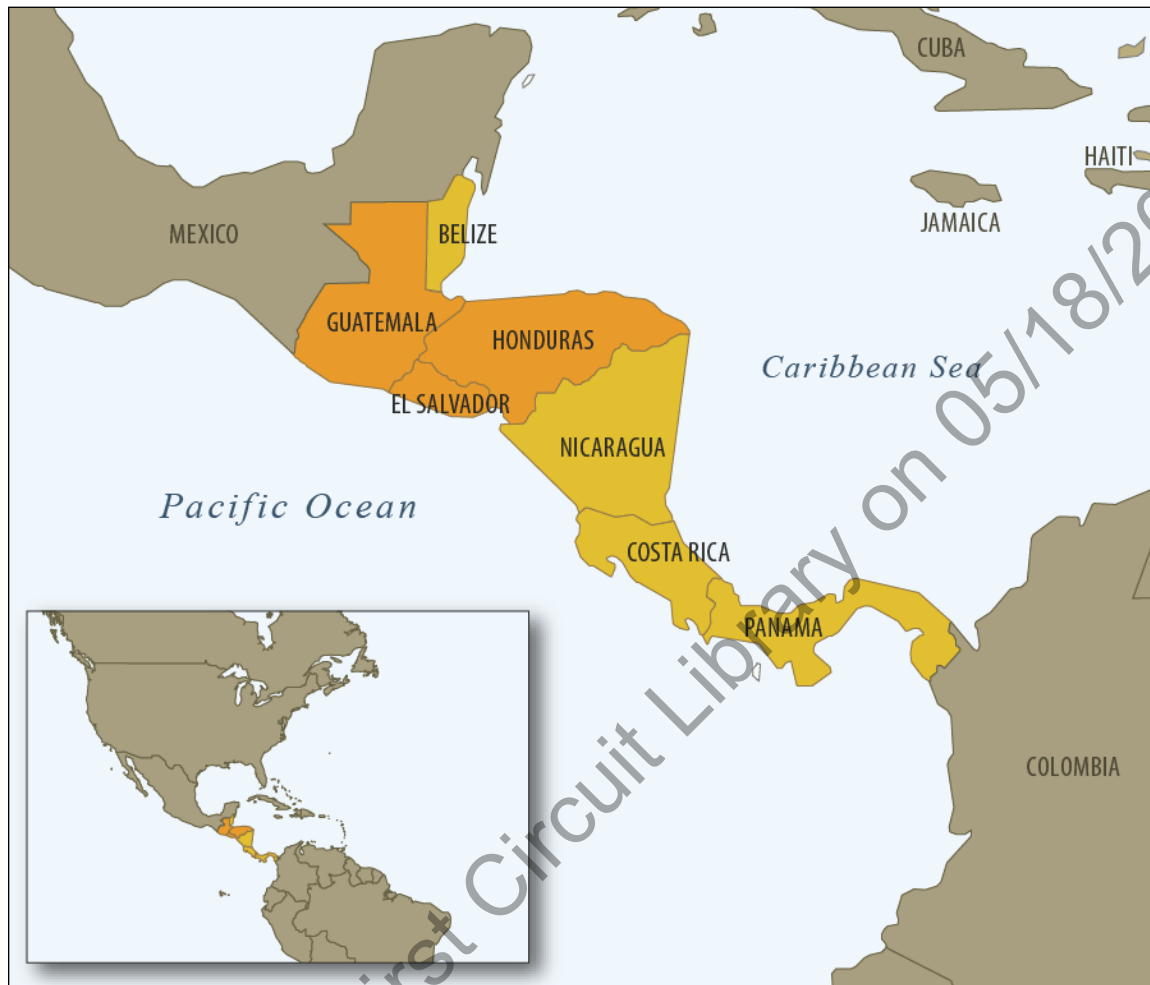
Figure I. Map of Central America