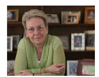
Adoptive parents speak up over mother who sent back Russian boy