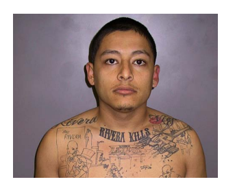
Gang tattoo leads to a murder conviction