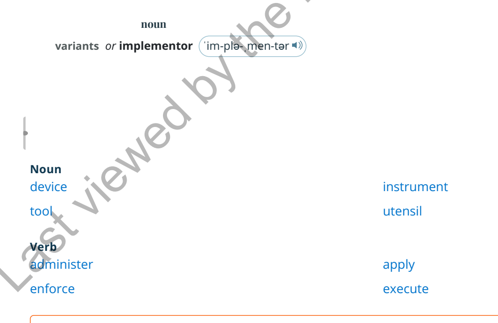
See all Synonyms & Antonyms in Thesaurus >

: to provide instruments or means of expression for 2