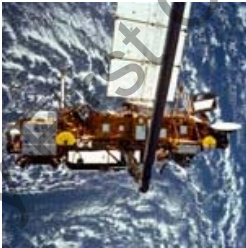
Dead Satellite's Fall Becomes a Phenomenon

Op-Ed: Bullying as True Drama Adults need to pay attention to the language of youth if they want antibullying interventions to succeed.