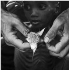
Video by Shirin Neshat: The Fall