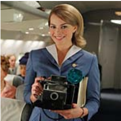
Television Review: Pan Am