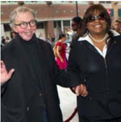
A Writer's Voice, Now Muted but Still Lively