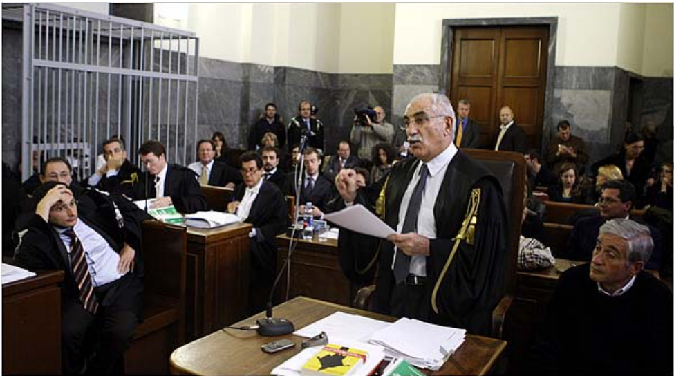
Armando Spataro, a prosecutor shown in Milan on Wednesday, achieved the first convictions involving the American practice of rendition, a significant symbolic victory. By RACHEL DONADIO Published: November 4, 2009

MILAN — In a landmark ruling, an Italian judge on Wednesday convicted a base chief for the Central Intelligence Agency and 22 other Americans, almost all C.I.A. operatives, of kidnapping a Muslim cleric from the streets of Milan in 2003.