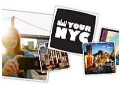
10 Things Everyone Should Do in NYC, According to Visitors