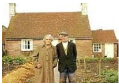
Elderly Couple Captures A Picture At The Start Of Every