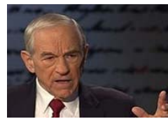
Dr. Ron Paul's Big Warning for U.S. seniors