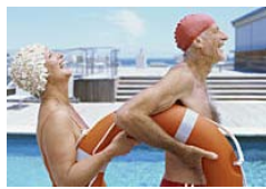
5 Surprising Signs of Cancer