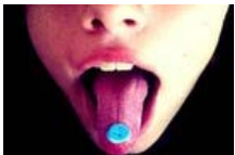
New "Genius Pill" Used By...