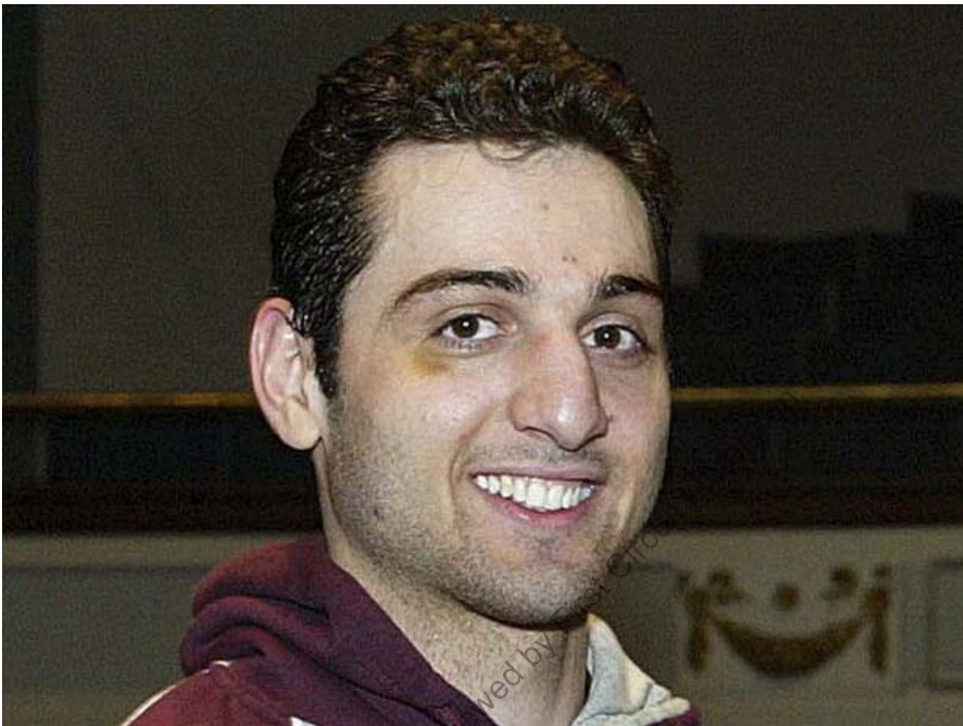
Dzhokhar Tsarnaev trial: Tamerlan Tsarnaev's mother-in-law says he was 'obsessed' with Islam