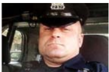
New Rule In Brookline, MA: