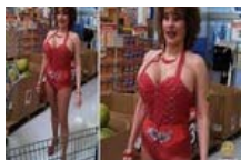
We Bet She Didn't Expect Walmart...