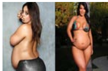
20 Celebs That Couldn't Stop Eatir ads