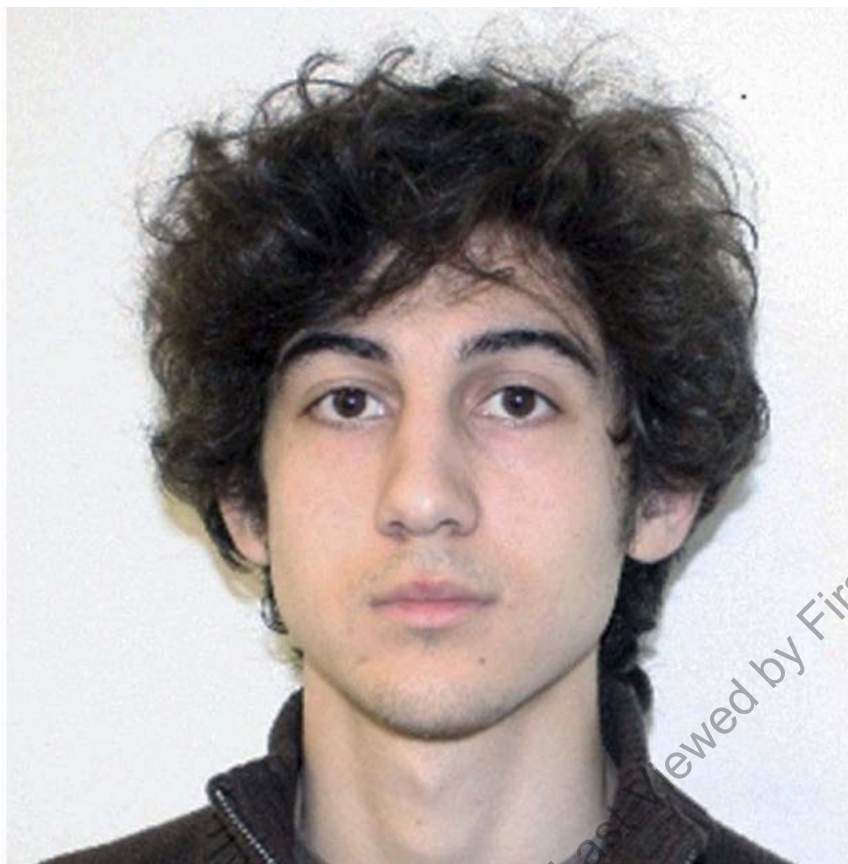
FOR RELEASE FRIDAY, DECEMBER 26, 2014, AT 12:01 - FILE - This file photo provided Friday, April 19, 2013 by the Federal Bureau of Investigation shows Boston Marathon bombing suspect Dzhokhar Tsarnaev. The legal aftermath of the Boston Marathon attacks dominated headlines in Massachusetts in 2014, much as the attack itself did last year and the accused bomber's trial surely will in 2015.

AP By The Associated Press on December 26, 2014 at 11:53 AM, updated December 26, 2014 at 12:12 PM