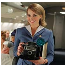
Television Review: Pan Am