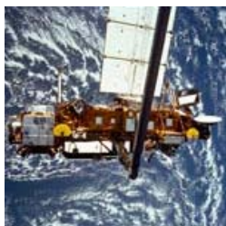
Dead Satellite's Fall Becomes a Phenomenon