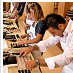
36 Hours in Perugia, Italy