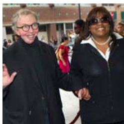
A Writer's Voice, Now Muted but Still Lively