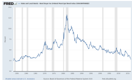
Monthly, Not Seasonally Adjusted