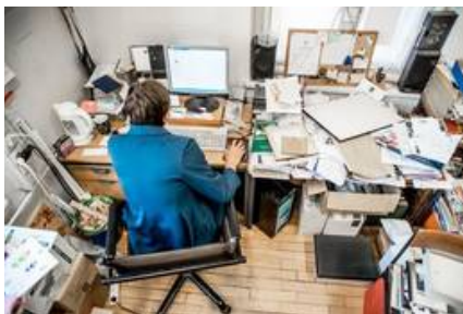
7 Words Related to "Work"