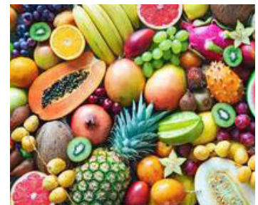
The Parts of the Fruit: Pericarp, and Mor