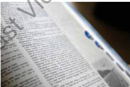
We Added New Words to the Dictionary for September 2019