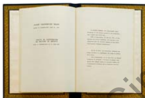
Final Act of the PCT